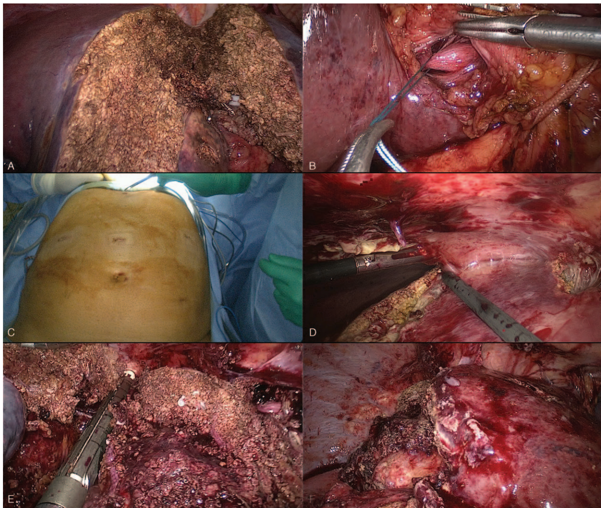
Figure 3. Main steps for totally laparoscopic ALPPS using selective hepatic artery clamping. (A) Liver partition is completed. (B) Right portal vein is ligated. (C) Second stage is also performed by laparoscopy and same trocar incisions from first stage were used. (D) Area of liver partition was separated with blunt maneuver. (E) Middle and right hepatic vein are divided with vascular endoscopic stapler. (F) Totally laparoscopic ALPPS is completed.

have the same beneficial effect of diminishing blood loss during hepatic transection while preserving hepatocellular function. This finding was confirmed by an experimental study using a murine model. [8]